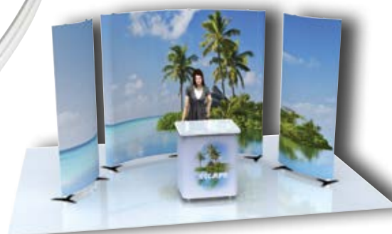
Multi-units in curved or flat