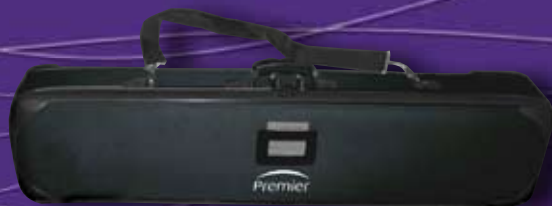
Deluxe hard case