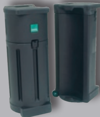
Premier™ T10 Case